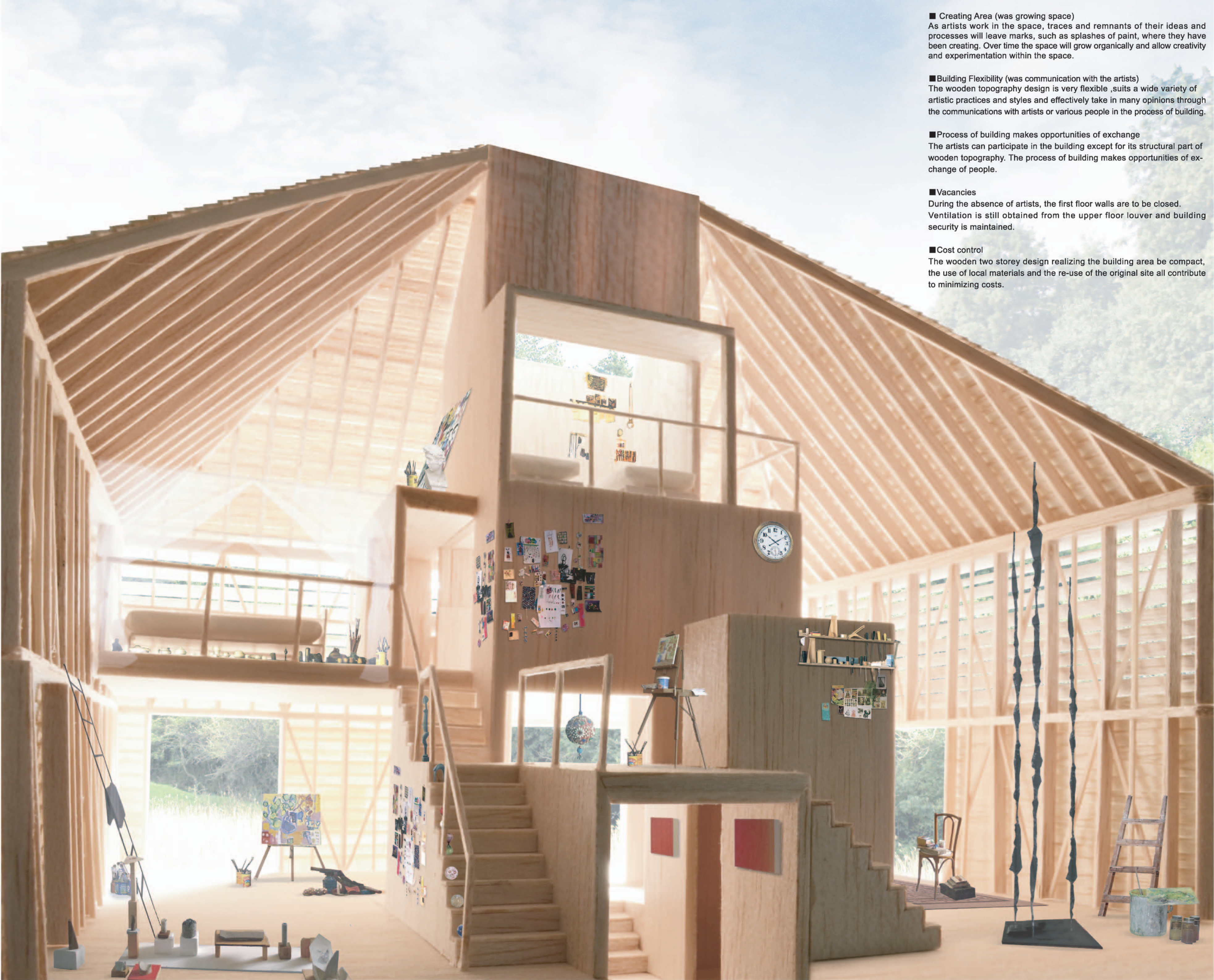
Interior Perspective The atelier and gallery are developed three dimensionally along to wooden topography.