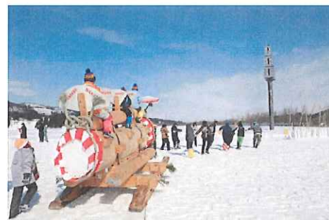
“Go Ahead on Big Sleigh”