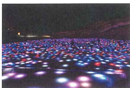
“Gift for frozen village”