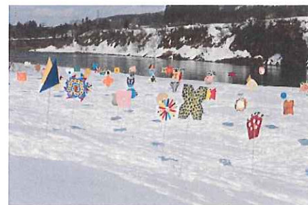
“Hyakkaryoran (profusion of flowers)”