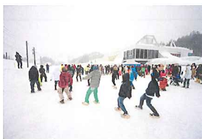
“Snow Shoes Dance”